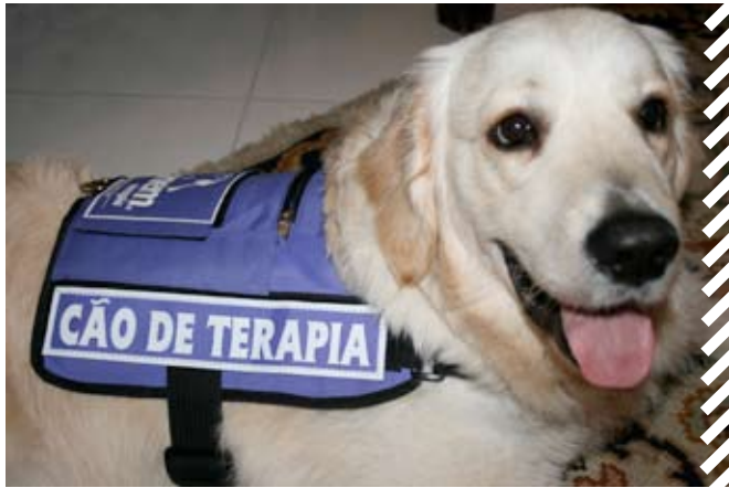
Trevo, Therapy dog of Canem delegacy, Lisbon.

Animal Assisted Therapy (AAT) it's a therapeutic modality in which an animal, in this case we talk about dogs, that fulfil certain requirements, works as an integrant and fundamental part of a project. In this kind of therapies multidisciplinary teams are used and are composed by health professionals (ex. psychologist, occupational therapist) who are responsible for setting each patient's individual therapeutics goals and follow their evolution, a canine guide who is responsible for controlling the animal, for evaluating his behaviour during the sessions and verifying his adequacy to the defined programmatic goals and a professional dog trainer, that although may not be present, has played an important role in the dog's education and training. It is a new world worth to know and develop.