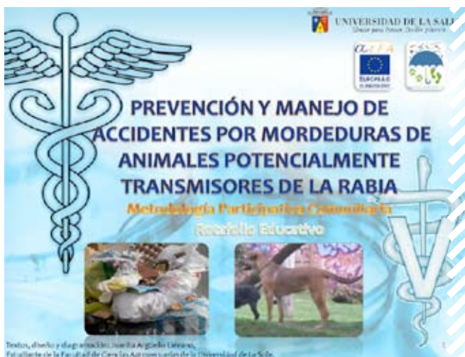
Flipchart about rabies prevention for rural populations.

Because we can do with Rabies, History together!