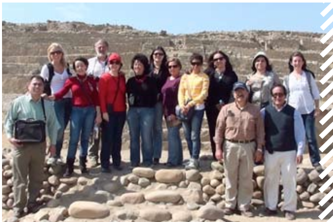
Some of the SAPUVET III members in the sacred city of Caral, the oldest American city.