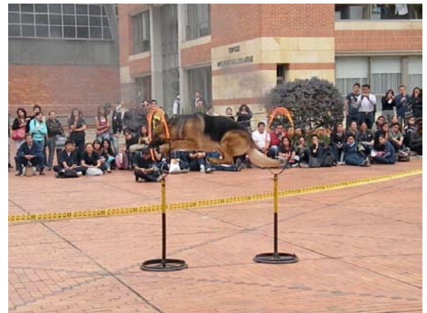
Agility dog show, National Colombian Police – Universidad de la Salle.